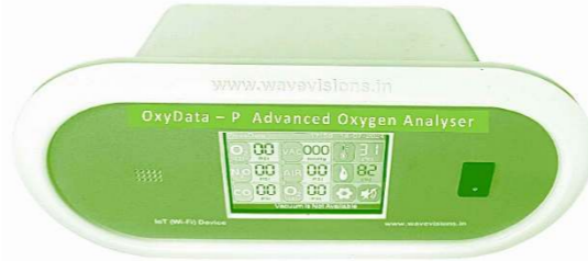
Panel Mounted Device